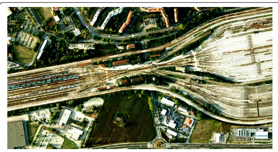
Figure 3 Example of a technological structure organized as a bow tie. Aerial view of the Bologna freight marshalling yard, clearly showing a structure analogous to a bow tie. Wagons arrive from a variety of sources (left bow); to facilitate control and sorting out operations, they are driven through a narrowing: few rails under strict supervision to ensure the maximal capability for control and decision-making; from here they are dispatched to a plethora of new destinations (right bow). Again, the narrowing (the 'core' surveillance station) allows economical and effective regulation to be taken and exercised on a variety of inputs (train provenances) and to yield a quantity of outputs (new destinations). Inspired by Needham [122], p. 170, Figure forty five.

time, to guarantee robustness and evolvability. Indeed, building blocks are modular (functionally independent) and can be recombined and reused through universal protocols to meet the demands of a rapidly changing environment. The core of the modular 'common currencies' facilitates system control, dampening the effects of noisy context and thus reducing fluctuations and disturbances.